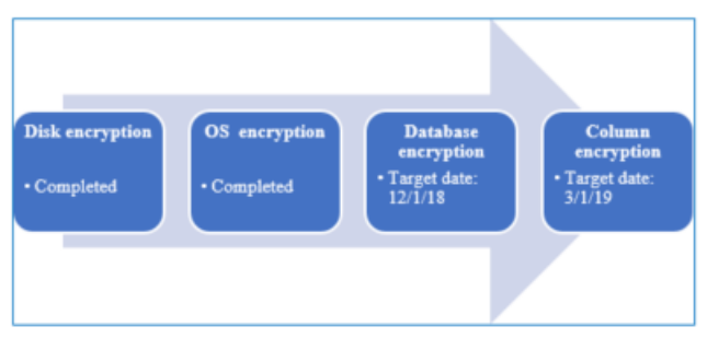
Figure 2 Reducing Risk with Encryption

Compliance with GDPR's security requirements will certainly not happen overnight. However, it is important that your organization has proactively assessed its risks and can demonstrate risk mitigation and forward progress across many domains (refer to the infograph GDPR: Article 32 and the Many Domains of Security). This "self-executed" data security as a fundamental principle is closely tied to GDPR's accountability principle, which in short means that your organization must be able to demonstrate its compliance with GDPR in a number of ways. Figure 2 uses the encryption domain as an example to demonstrate practical progress while also reducing risk. In contrast, standing still and maintaining the status quo is not a viable strategy, especially in the eyes of the data protection authorities. A practical and prioritized approach, one that demonstrates risk management and forward progress, is indispensable.